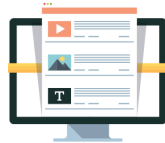
Blogging & Social Media