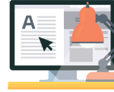
Research & Content Development