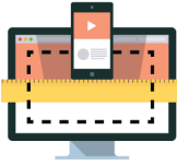
Full Responsive Website Redesign